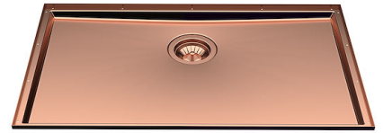
Sink Phantom Base Copper 5557 148